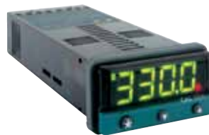
Model 3300 48 x 24 mm (1/32 ND DIN)